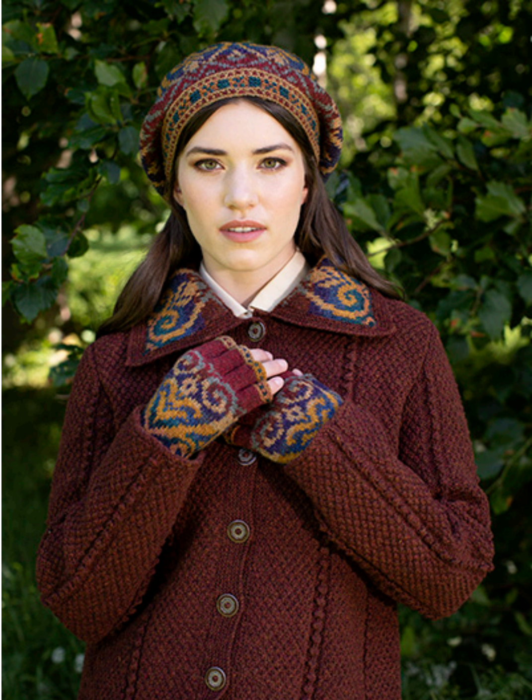
Ellie in a hat set and Henrietta Cardigan