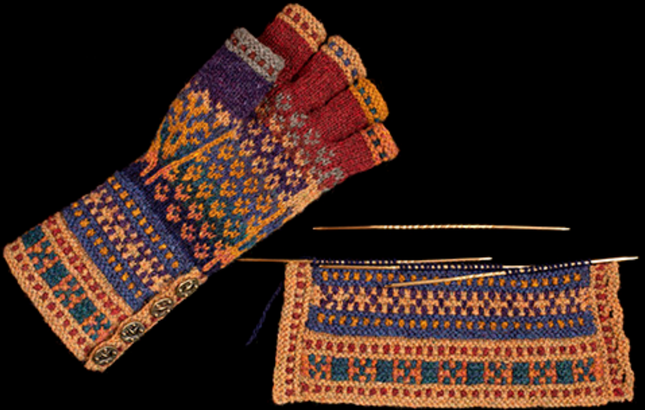
The glove cuffs in the making